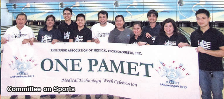
Committee on Sports