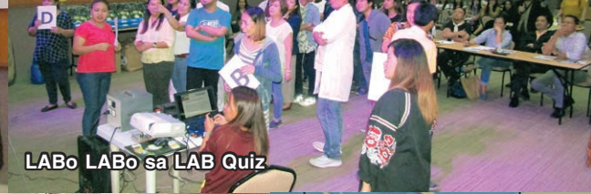
LABo LABo sa LAB Quiz