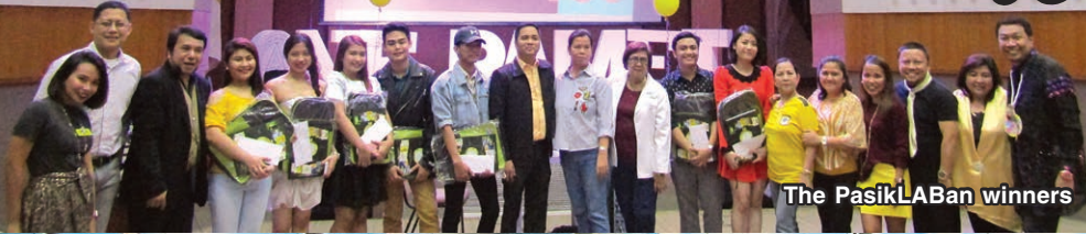
The PasikLABan winners